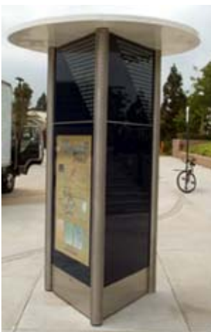
CeroView's Citadine kiosk can easily be spotted by commuters.

fiberglass canopy shelters kiosk users from bad weather. A glass panel on one side of the kiosk displays Norwalk Transit's system map and serves as an access door for servicing the kiosk. The eight-foot tall kiosk is connected to the Internet using DSL.